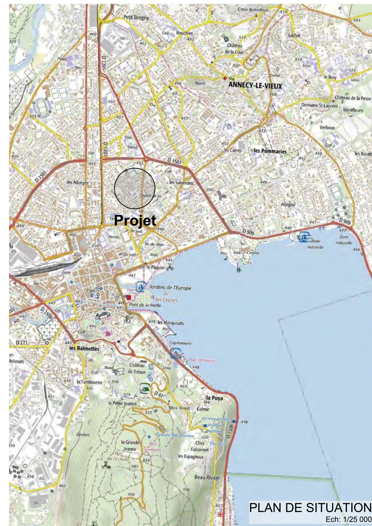
PLAN DE SITUATION Ech: 1/25 000